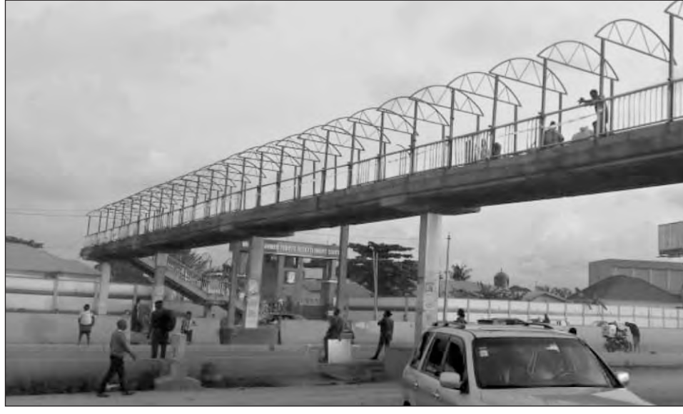
Charity Oshodi pedestrian bridge

"In the next two weeks, He added that the potholes NACHO bridge was stones to give easy access to