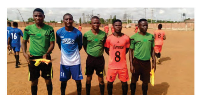
Rocky Star FC vs Praise King FC

Rocky Star had most of the ball possession in the first half but could not find the back of