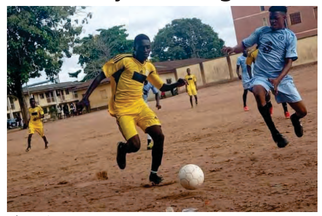
Ghetto Tigers vs YBS FC

YBS FC's display in the second half showed they were very