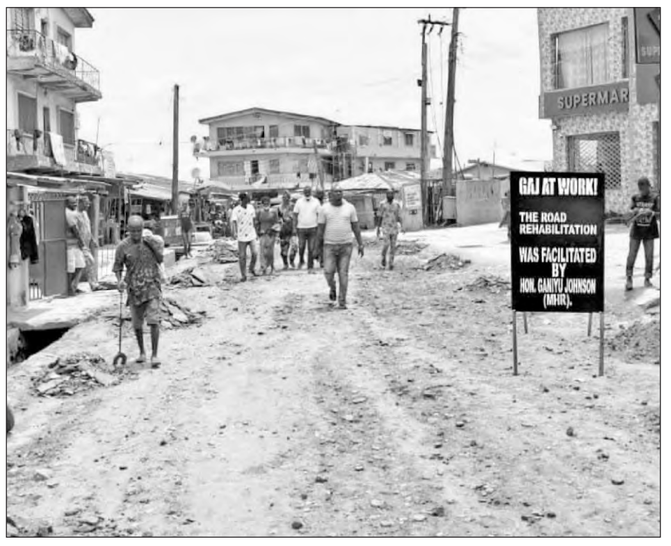
Salamotu street rehabilitation

In the letter dated Monday, February 17, 2020, titled